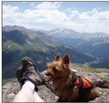
Emme the Australian terrier in training to climb four fourteeners.