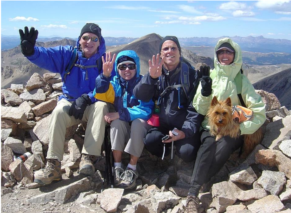
The whole crew at the fourth summit of Mt. Bross

After a short celebration and a few cell phone calls (which often work from up that high) we began our descent. That's when we figured out why Bross might have been closed — the descent was a steep downward ridge walk with lots of loose scree, probably added to by the record snowmelt after last winter.