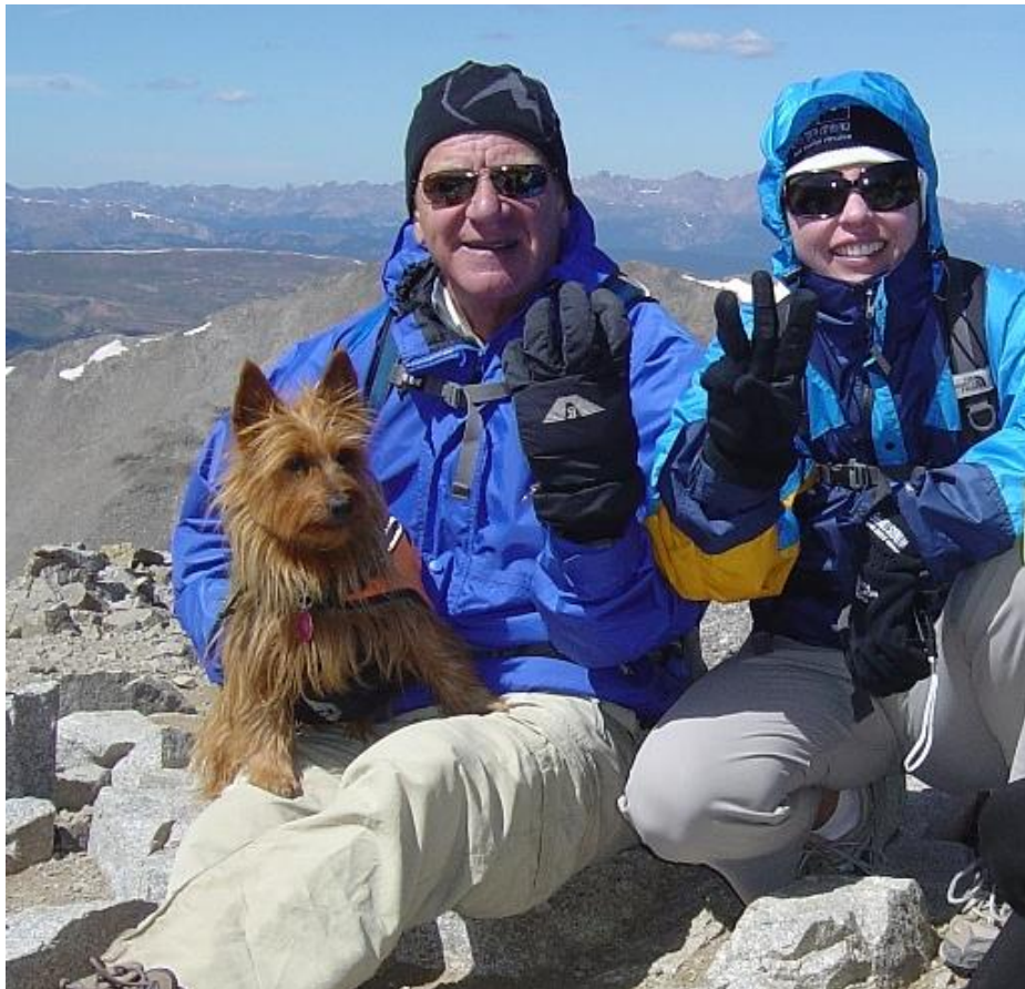
Summit #3: Mt Lincoln.

The final peak was Mt. Bross at 14,172 feet. I was starting to feel the length of the day and had already talked my legs into heading up-mountain three times. I wasn't sure I was up for the fourth peak, but