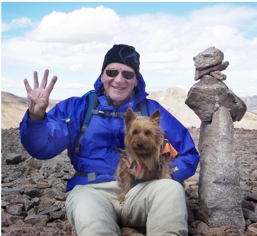
Mt. Bross, the fourth summit.

Mt. Bross has two false peaks before the real summit which was a painful tease at the end of our day, but finally we were there.